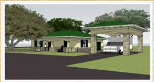
Council on Aging Transportation Center will be occupied in the spring of 2012